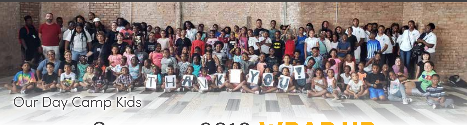
Our Day Camp Kids