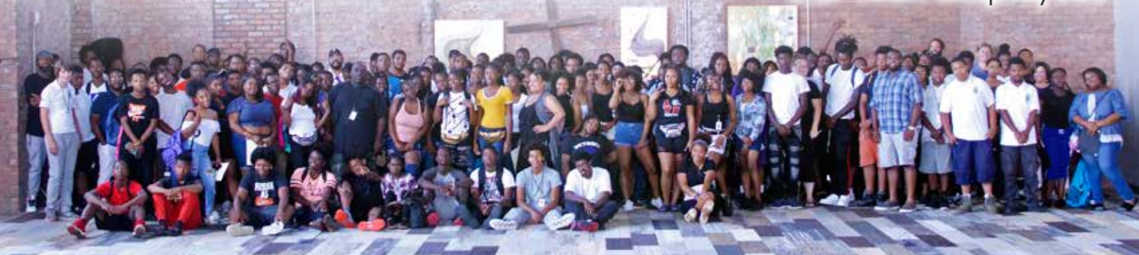
Our Teen Employees